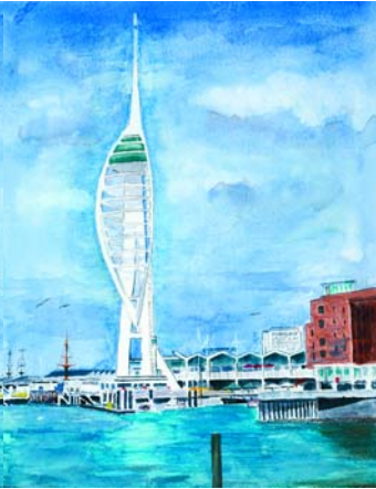
M.W. X 3