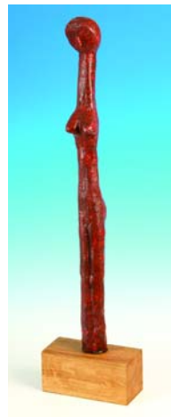
M.W. X 4