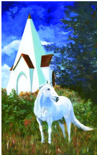
M.W. X 3