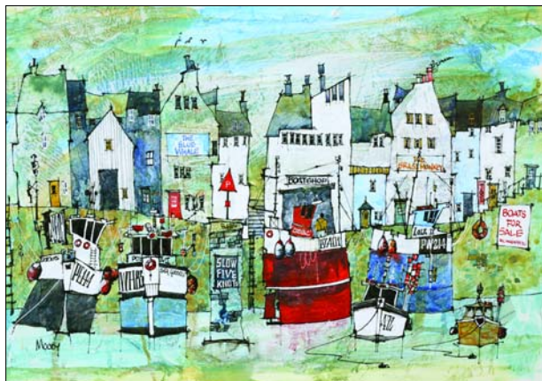
M.W. X 2