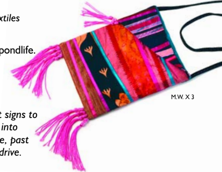
M.W. X 3

MIKE photographs of Hampshire villages, architecture, ponds and pondlife. WENDI textile bags; paintings with Egyptian and Indian themes. 95 Station Road, Netley Abbey, Southampton SO31 5AH 02380 454241 mikewatson.photography@zoom.co.uk 02380 453475 wendi.watson@virgin.net From M27 J8 take the B3397 signed Hamble. Follow brown tourist signs to Netley Abbey and Victoria Country Park. Before Hamble turn right into Hound Road, which finally becomes Station Road. Over small bridge, past two right turnings. 95 is a bungalow on a right hand bend. Park in drive. Or take the train – the station is 500 yds from us. One low step