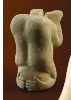
M.W. X 3